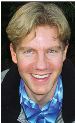
Victim? Bjørn Lomborg accuses critics of mudslinging.

The Danish Research Agency’s Committee on Scientific Dishonesty (DSCD) launched an investigation in mid-2002 into allegations that Lomborg selected sources to fit his views. For example, he was accused of disregarding known extinction rates when estimating species loss and glossing over uncurbed population growth in some regions when discussing the reassuring implications of a global slowdown in population. After the DSCD issued its ruling last year ( Science , 17 January 2003, p. 326), Lom-