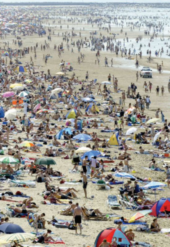
Future summers are set to mirror 2003, when even the Netherlands enjoyed unusual heat.

tieth century is likely to have been the largest in any century during the past 1,000 years.”