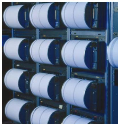
On shaky ground: researchers studying GM crops and seismic data are also plagued by uncertainty.