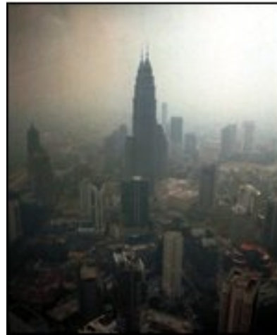
Third world emissions are rising fast

Ari Fleischer, the White House spokesman, said: "The president has been unequivocal. He does not support the Kyoto treaty."